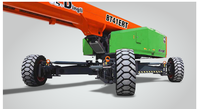
Brand New One-Key In-Situ Axle Expansion Technology Global Patent Protection