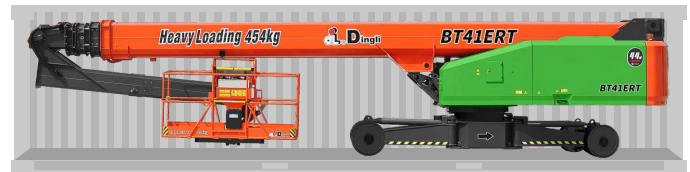
Standard Container Transport