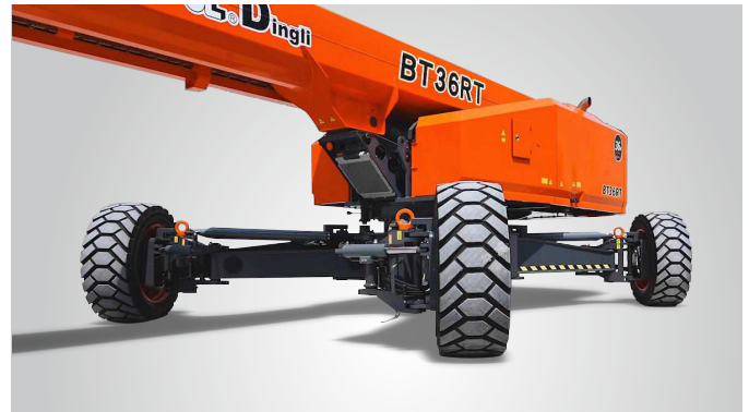
Brand New One-Key In-Situ Axle Expansion Technology Global Patent Protection