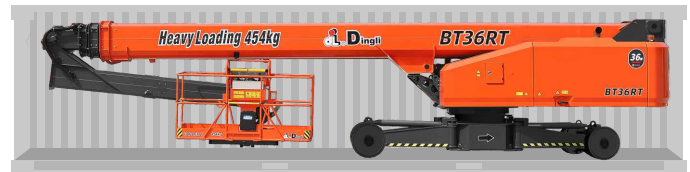
Standard Container Transport