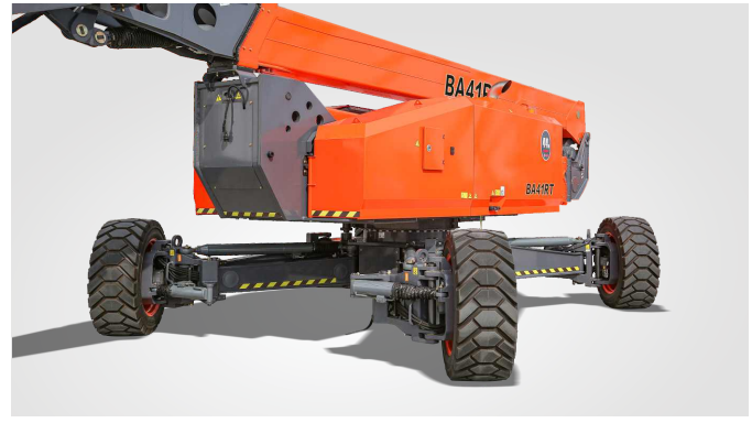
Brand New One-Key In-Situ Axle Expansion Technology Global Patent Protection