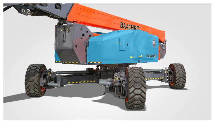
Brand New One-Key In-Situ Axle Expansion Technology Global Patent Protection